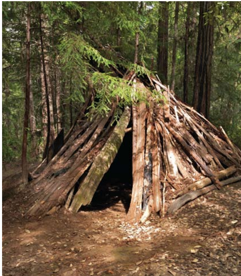
Hendy Hermit's hut

Picnicking —Near the banks of the Navarro River, 12 picnic sites with barbecue stoves and tables overlook the Big Hendy Grove.