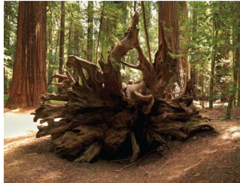
Fallen redwood tree root system

The most outstanding features of this 845-acre park are the two redwood groves on the flats along the Navarro River. Some of these trees stand more than 300 feet tall and may be close to 1,000 years old. Madrones, Douglas firs and California laurels share the cool shade of the redwoods. Massive stumps and fallen trees lie covered in moss. Beneath the old-growth giants, ferns and redwood sorrel blanket the ground, and soft, decomposed redwood duff mutes all sound to a mellow hush.