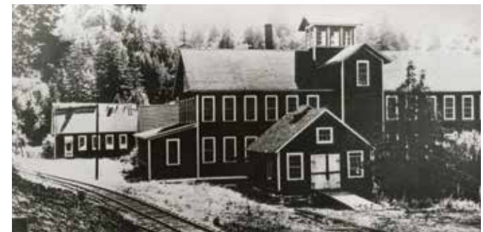
Pioneer Paper Mill

Chert and sandstone underlie well-drained soil that hosts profuse vegetation. Shaded, fern-filled groves of coast redwoods, Sequoia sempervirens , are found along the canyon bottoms and up the north-facing slopes. The striking Aralia californica , or elk clover, displays immense leaves with huge cream-colored flowers blossoming in early summer. Oak and madrone hardwoods dominate the park's grasslands.