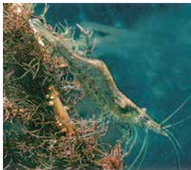
California freshwater shrimp

Trails —A wide network of fire roads and hiking, nature, and equestrian trails wind through the park. The scenic,