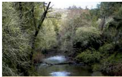
Lagunitas (Papermill) Creek

Parking, campsites, restrooms, and showers in the Creekside and Orchard Hill loops, the Azalea Hill picnic area, and day-use restroom are accessible. Two