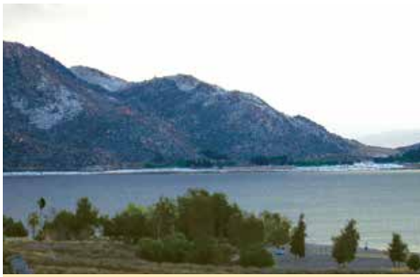
Rare snowfall on Bernasconi Hills

For thousands of years, the native California groups who lived here enjoyed the area's abundant resources and mild climate. Food, water, shelter, and clothing were plentiful. The native people hunted antelope, bighorn sheep, deer, rabbits, birds, and a variety of small mammals. Native seasonal houses