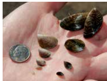
Quagga mussels at various growth stages

To pass the free inspection and help prevent the spread of these mussels, please make sure your vessel is clean, the bilge and all engine vessel compartments are drained and dry, and the entire vessel is free of any water. For mussel facts and questions about the inspection process or requirements, visit http://www.resources.ca.gov/quagga .